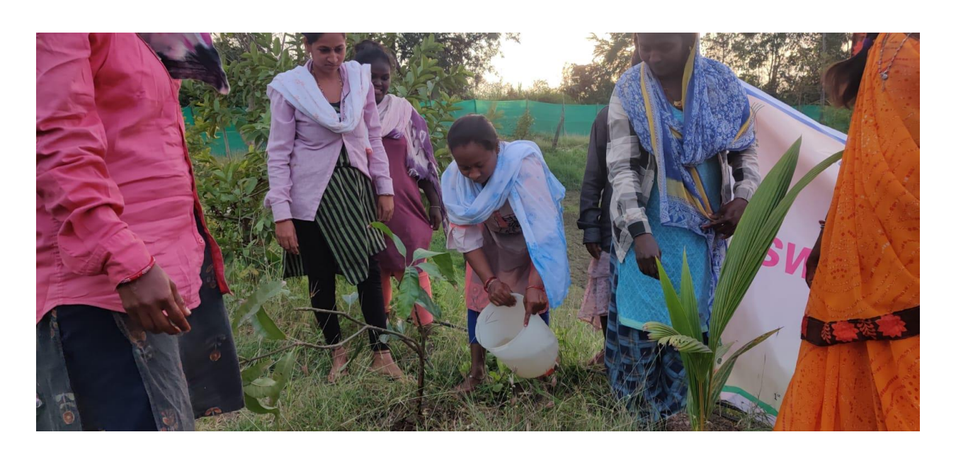
Planation of saplings by tribal farmers at Singod Village, Navsari, Gujarat