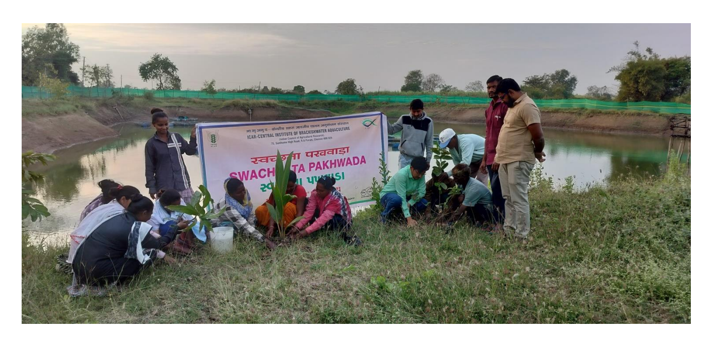
Planation of saplings by tribal farmers at Singod Village, Navsari, Gujarat