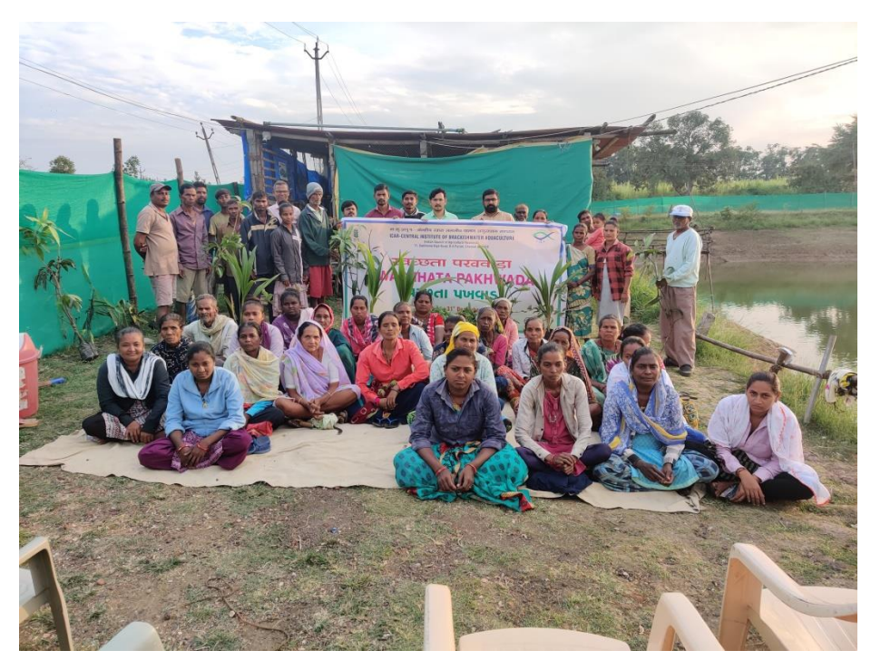
Awareness programme on Kitchen gardening and distribution vegetable saplings at Singod Village, Navsari, Gujarat

Navsari-Gujarat Research Centre of ICAR-CIBA organized Swachhta Pakhwada at Vill. Singo, Navsari, Gujarat on 21<sup>st</sup> December 2023. On this occasion, scientists of the centre addressed a group of 40 farmers from the adopted tribal village about the necessity of cleanliness and kitchen gardening. CIBA scientists addressed the farmers about the importance of utilization of homestead and fish pond fallow land by converting to kitchen garden for cultivation of horticultural crops that provide extra incomes, meet up domestic needs for vegetables and nutrition, and create clean and esthetic surroundings of a house. This would also help in keeping house premise weed free and maintaining healthy organic environment. Therefore, maintenance of kitchen garden as a household activity by small and marginal farmers is promoted in the adopted tribal village and tribal farmers are doing kitchen garden with the help of CIBA- NGRC Centre. As a part of the Swachhta Pakhwada programme, villagers participated in the horticulture activity and cultivation of crops on the pond dykes and with irrigation from harvested pond water.