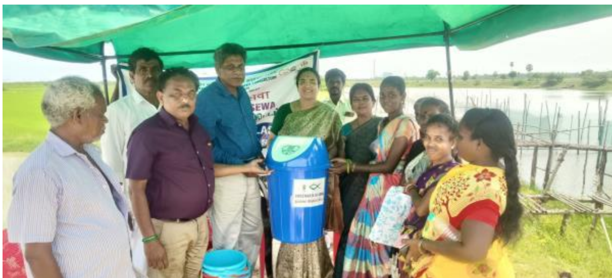
ICAR-CIBA, Chennai conducted awareness on cleanliness and waste management among coastal communities at Kattur village, Pulicat, Tamil Nadu

ICAR-CIBA, Chennai conducted an awareness on cleanliness and waste management among coastal communities at Kattur village, Pulicat, Tamil Nadu to sensitize the coastal women, men, youth and children on impact of minimizing the use of single usage plastics in the coastal/tourism places to make our country greener and plastic free. Around 30 villagers attended the programme. The program was intended to create awareness among the coastal communities on the side effects of single use plastics and introduce them to the national mission on cleanliness, sanitation and hygiene. Awareness sessions on importance of village based swachhata campaigns, effects of plastic on marine life and oceans, importance on minimising plastic usage, recycling of fish waste to value added products etc were given to the coastal communities by CIBA Scientists and staff.