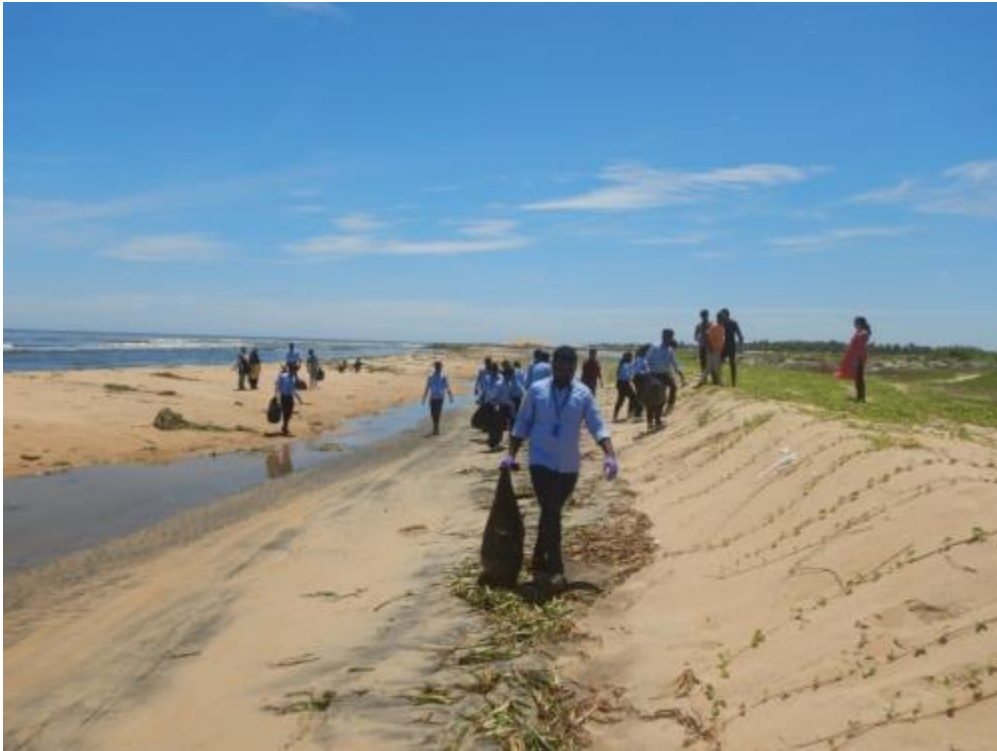
ICAR-CIBA organised Cleaning of Muttukadu beach areas nearby Muttukadu Experimental Station of CIBA, Tamil Nadu

Plastics and affirmed solemnly on avoidance of Single Use Plastics to make our country greener and plastic free.