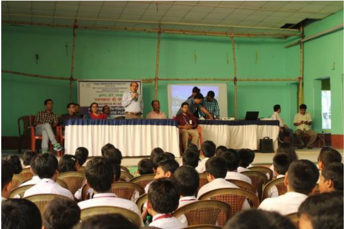
Awareness cum quiz programme at Sundarban Adarsha Vidyamandir, Kakdwip, West Bengal