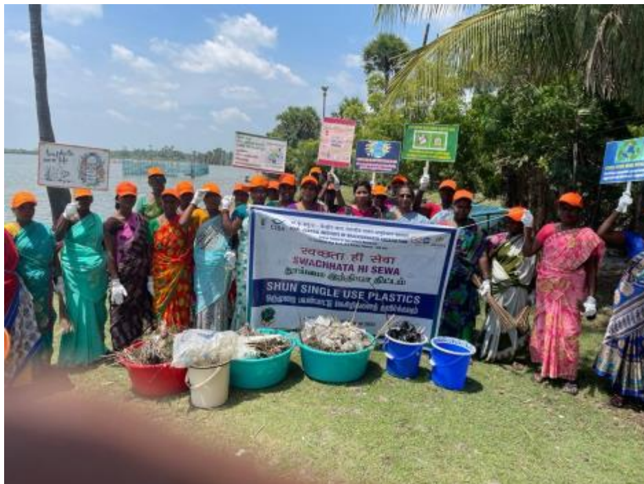
ICAR-CIBA organized awareness cum cleaning program at Kottaikadu village, Kancheepuram district, Tamil Nadu