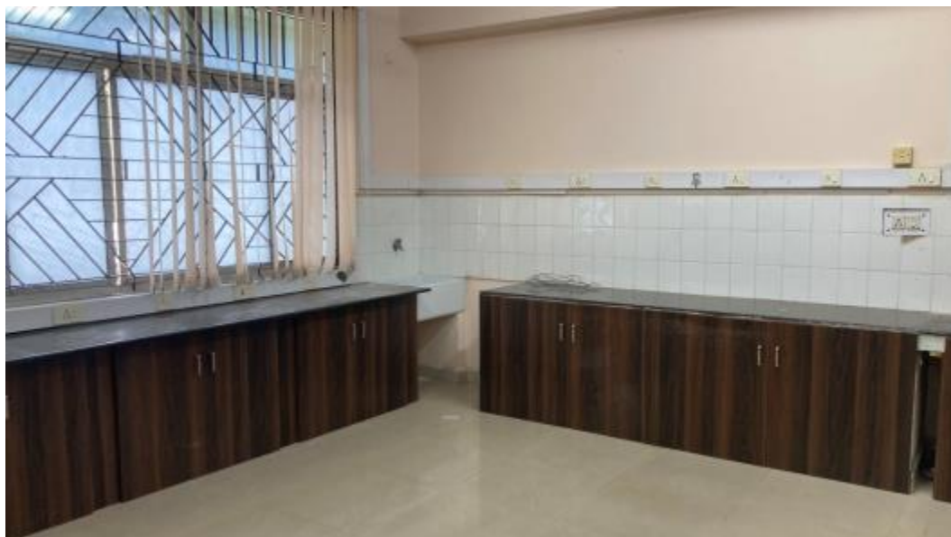
After cleaning of Laboratory building, ICAR-CIBA, Chennai, Tamil Nadu