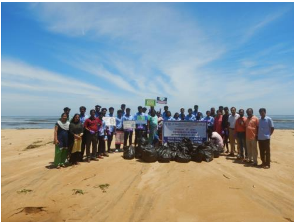
ICAR-CIBA organised Cleaning of Muttukadu beach areas nearby MES of CIBA, Tamil Nadu