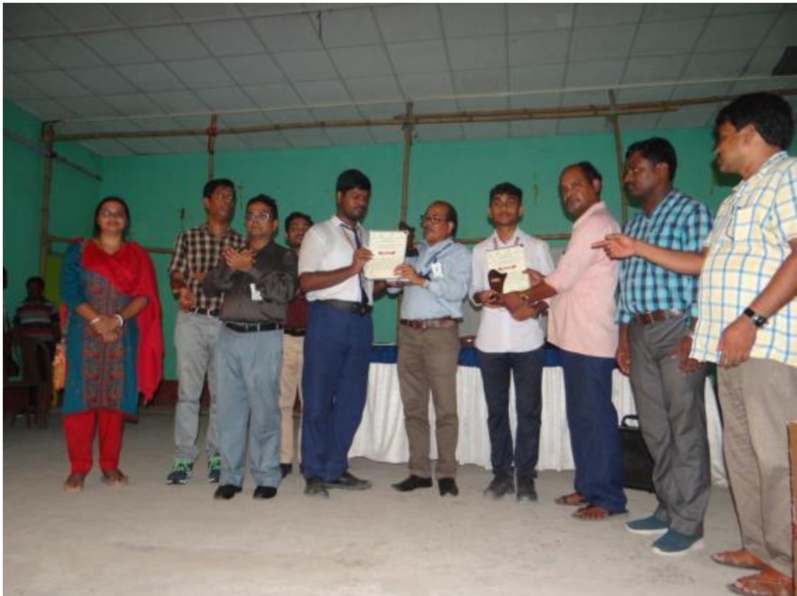
Prize and certificate distribution - Awareness cum quiz programme at Sundarban Adarsha Vidyamandir, Kakdwip, West Bengal