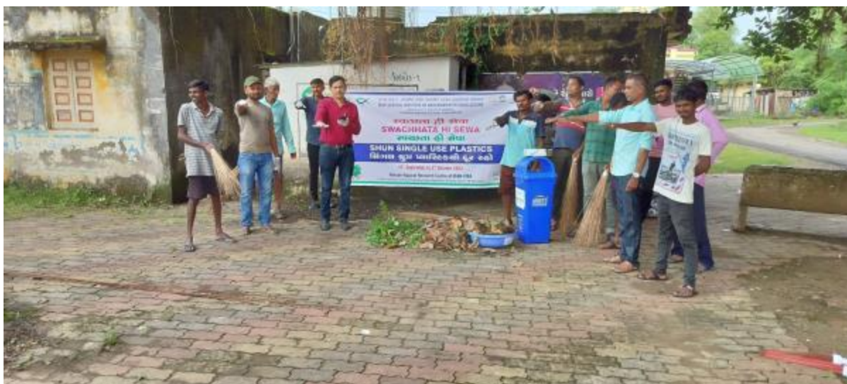
Swachhta Pledge for maintaining hygiene and cleaning of public places at Singod, Navsari district, Gujarat - NGRC of CIBA, Gujarat

Kakdwip Research Centre of ICAR-CIBA, Kakdwip West Bengal, conducted awareness cum quiz programme of cleanliness and importance of food waste management among school students at Sundarban Adarsha Vidyamandir, Kakdwip as a part of Swachhata Hi Sewa (SHS) campaign of Govt of India. Around 140 participants including staffs of KRC, students of Class V, VI, XI and XII and teaching & non-teaching staffs of Sundarban Adarsha Vidyamandir attended the programme. At the beginning of the programme, CIBA scientists addressed the gathering and highlighted the Swachh Bharat Mission aim and objectives; importance of cleanliness, hygiene and sanitation; and health issues due to usage of single use plastics. They expressed that the greatest way to prevent food waste is to have a system in place for creating nutritious, healthy, and long-lasting food. They also emphasised that the school can set up a composting area because food scraps can enhance the soil with nutrients while also lowering your carbon footprint.