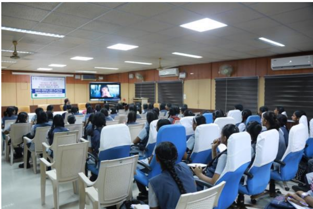
ICAR-CIBA, Chennai, has organized the Swachhata Hi Sewa 2023 programme for school students

Massive mobilization for plastic waste shramdaan among school students was conducted at MES of ICAR- CIBA, Muttukadu, Tamil Nadu to create awareness on waste management, cleanliness, hygiene, sanitation and taken pledge for single use plastic ban and discharge the use of plastics in the programme. CIBA Scientist explained about Swachh Bharat Mission aim and objectives; and importance of self-help principles, hygiene, sanitation and health issues due to usage of single use plastics. Single use plastics related videos were showed to students for creating awareness. Followed by students were planted trees inside experimental station as a simple of go green campus. More than 120 students from Sri Sankara Global Academy, Kilattalai, Chennai, were participated in the programme.