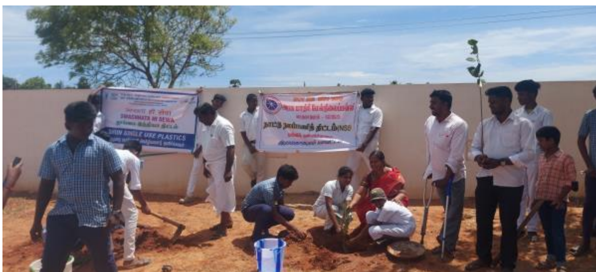
ICAR-CIBA, Chennai conducted tree plantation program at Govt Higher Secondary school, Regunathapuram village, Ramanathapuram district, Tamil Nadu

Muttukadu beach areas nearby MES of CIBA, Muttukadu, Tamil Nadu were cleaned with active participation of CIBA staff and Tamil Nadu Dr. J. Jayalalithaa Fisheries University college students as part of Swachhata Hi Sewa. More than 40 participants including students and staff attended the programme. Various Placards explaining about different means to avoid plastic waste and a pledge in this regard was administered to the participants. The participants understood the importance on the call on shun Single Use