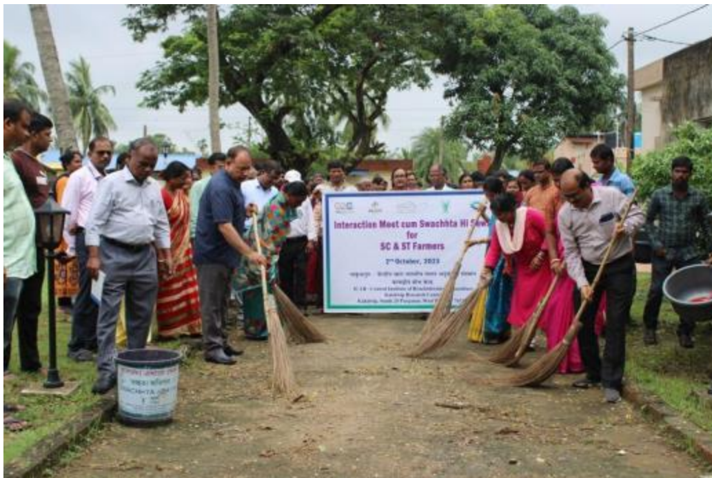
Awareness program on swachhata hi sewa and shun single use plastics for scheduled caste and scheduled tribe farmers at KRC of CIBA, Kakdwip, West Bengal