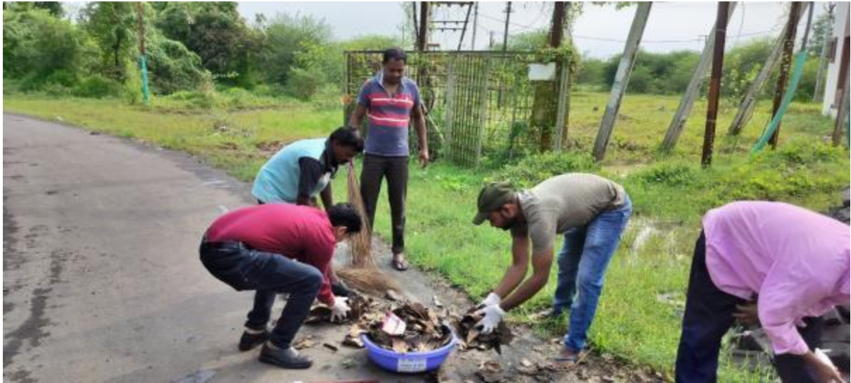
Cleaning of roadside surrounding areas at Singod, Navsari district, Gujarat - NGRC of CIBA, Gujarat