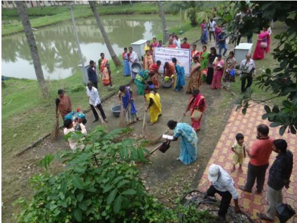
Awareness program on swahhata hi sewa and shun single use plastics for scheduled caste and scheduled tribe farmers at KRC of CIBA, Kakdwip, West Bengal