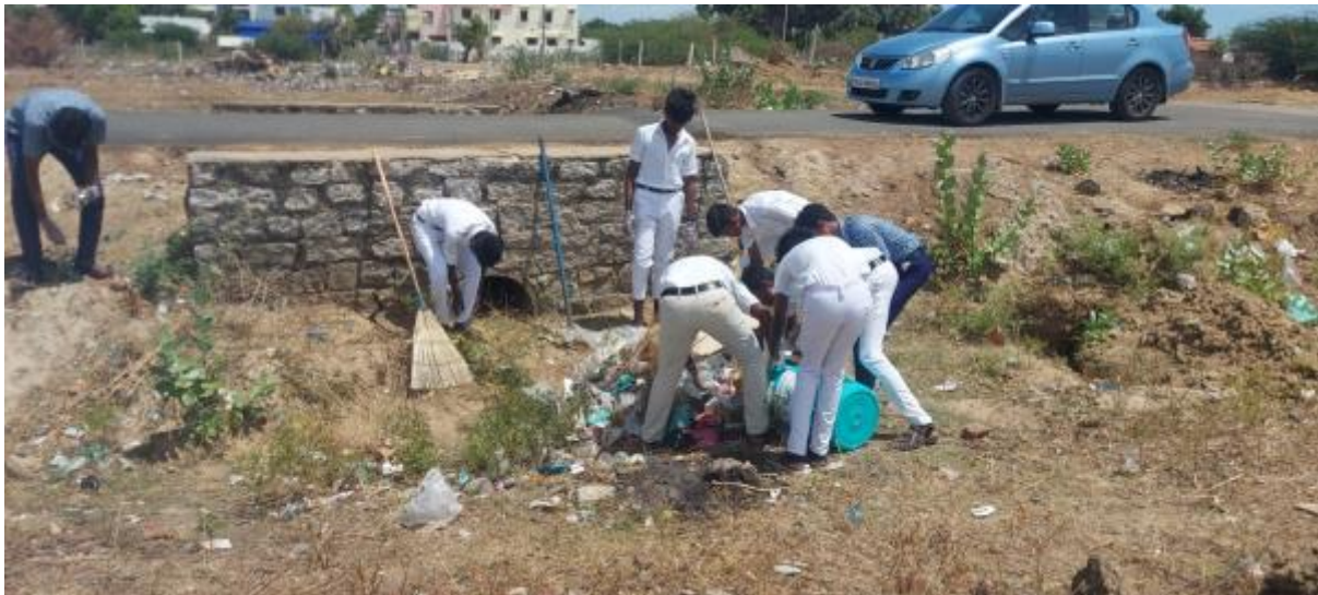
ICAR-CIBA, Chennai conducted cleaning program at road side, Regunathapuram village, Ramanathapuram district, Tamil Nadu