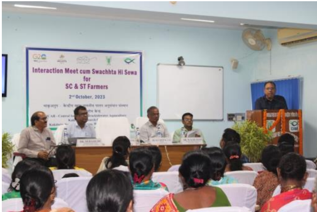
Awareness program on swachhata hi sewa and shun single use plastics for scheduled caste and scheduled tribe farmers at KRC of CIBA, Kakdwip, West Bengal

the staff of KRC and invited farmers were organized inside the campus. More than 60 participants including farmers, scholars, and staff of KRC attended the programme.