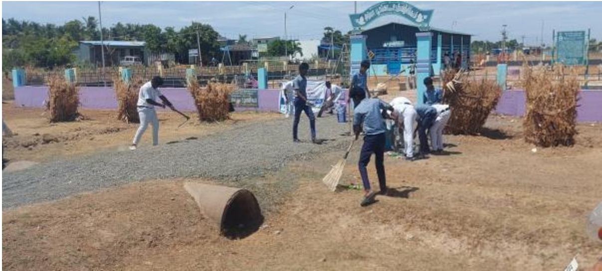
ICAR-CIBA, Chennai conducted cleaning program at Govt. Higher Secondary school, Regunathapuram village, Ramanathapuram district, Tamil Nadu

plastic ban. Followed by tree planation and also cleaning of school campus and road side areas were done by the participants.