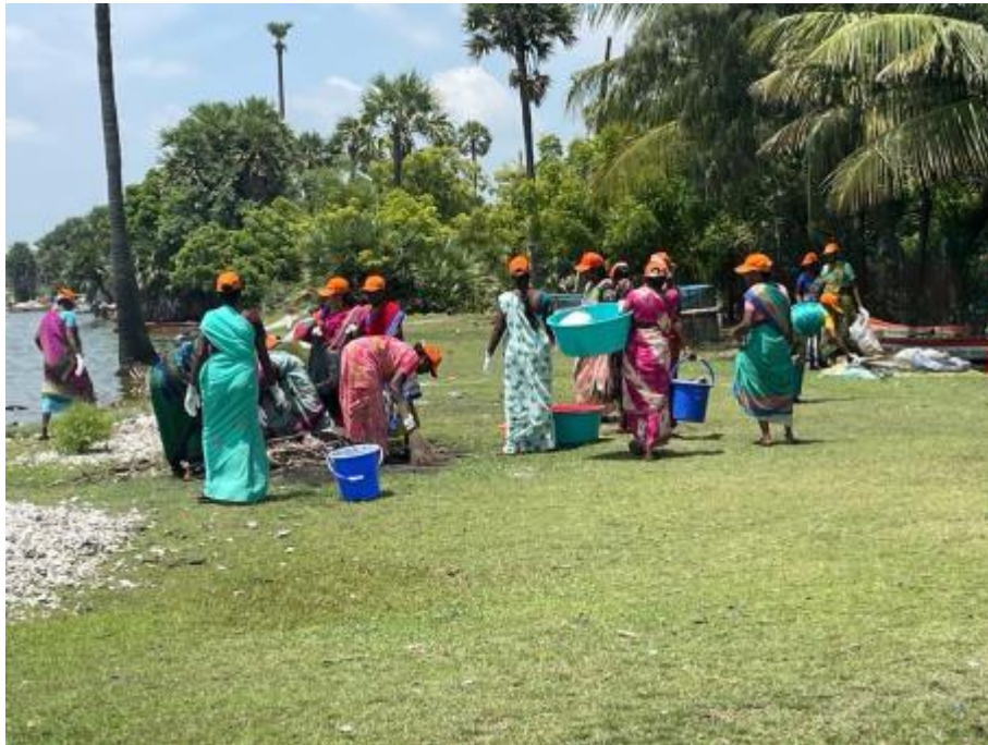
ICAR-CIBA organized awareness cum cleaning program at Kottaikadu village, Kancheepuram district, Tamil Nadu

respectively. Followed by their village coastal/backwater areas were cleaned by removing of plastics, weeds etc