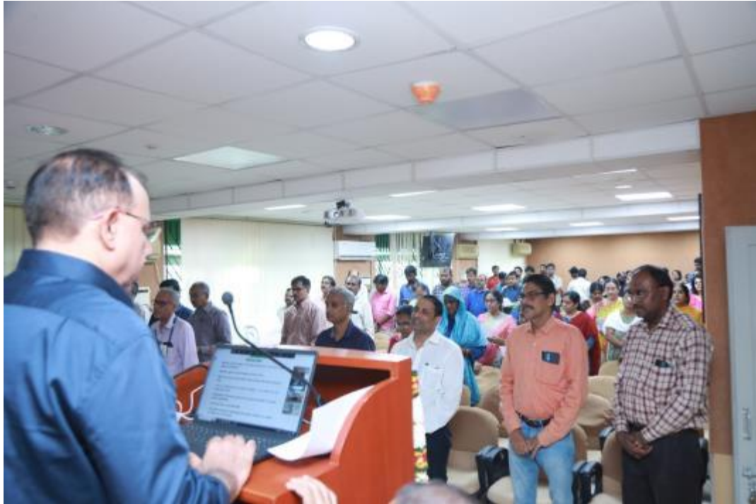
Swachhata Pledge at ICAR headquarters, Chennai, Tamil Nadu