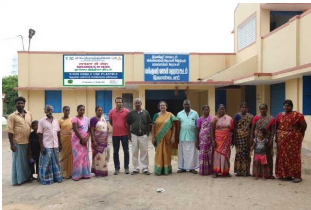
Awareness program on “Waste to Wealth” at Kilakondaiyur village, Thiruvallur district, Tamil Nadu- ICAR-CIBA, Chennai

ICAR-CIBA trained Self Help Group members have demonstrated the protocol for recycling of fish waste to value added products to participants. CIBA Scientist highlighted the importance of cleanliness in the villages and recycling of fish waste to avoid infections and diseases. Recycling will not only help in cleaning and hygienic disposal of fish market waste which is abundantly available in the village cluster but will also help to produce wealth from waste.