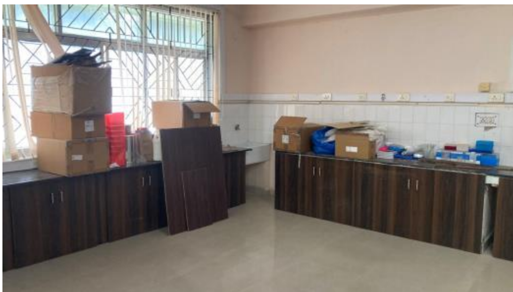
Before cleaning of Laboratory building, ICAR-CIBA, Chennai, Tamil Nadu