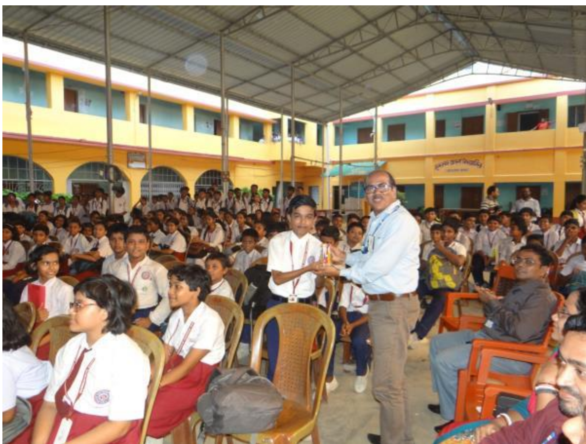
Prize and certificate distribution - Awareness cum quiz programme at Sundarban Adarsha Vidyamandir, Kakdwip, West Bengal