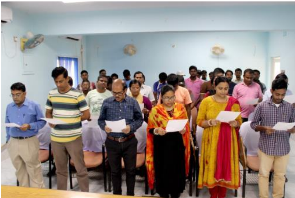
Swachhata Pledge at KRC of CIBA, Kakdwip, West Bengal