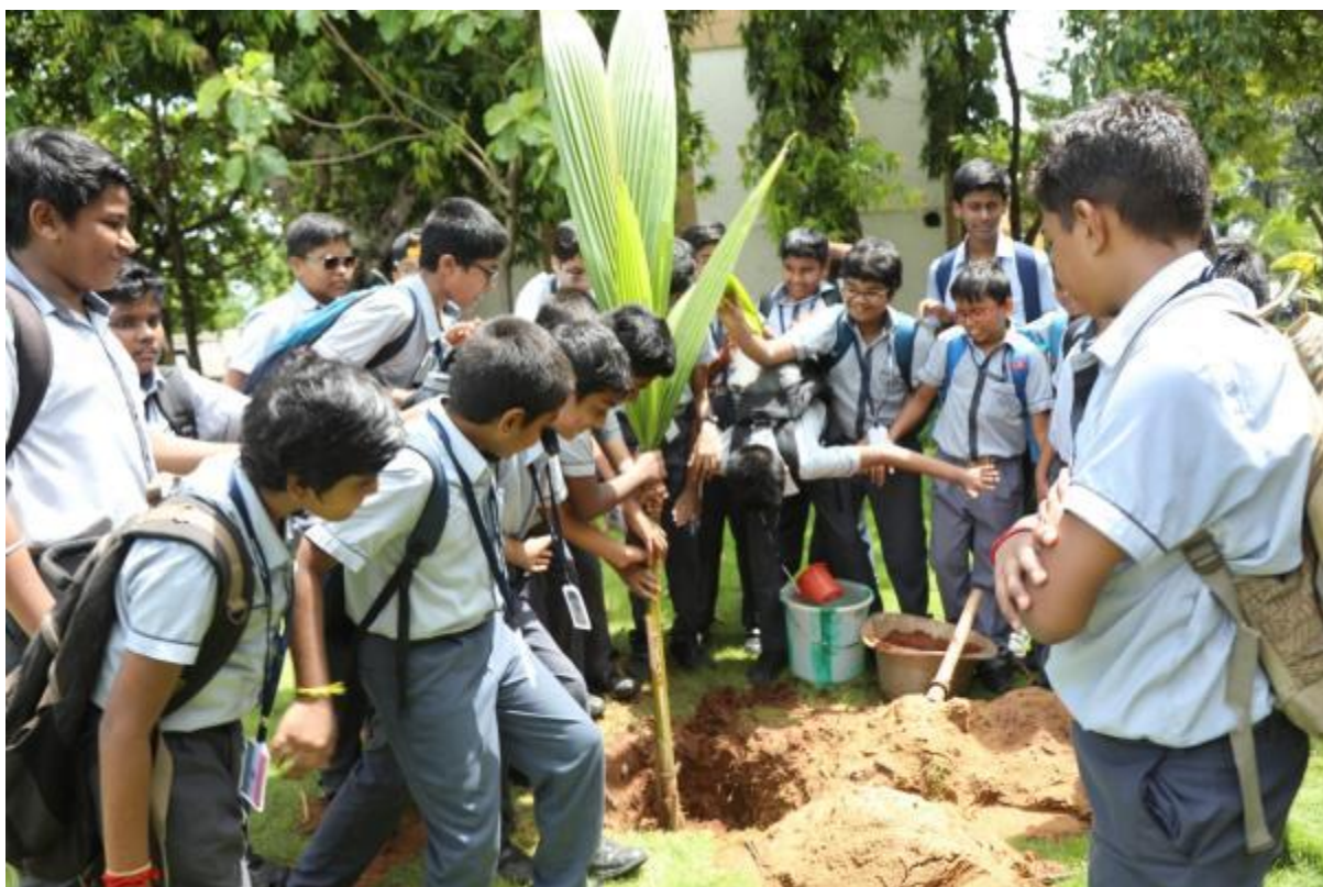
Tree planation by school students of Sri Sankara Global Academy, Kilattalai, Chennai at MES of CIBA, Muttukadu, Tamil Nadu

Navsari Gujarat Research Centre (NGRC) of ICAR- CIBA, Navsari, Gujarat, has organized the Swachhata Hi Sewa 2023 programme at Primary school and village premises of Singod village, Navsari, Gujarat, to create awareness on cleanliness, hygiene, sanitation and shun the single use plastic among the students and villagers, door to door meeting and removal of waste from the village premises. Followed by the awareness meeting, staff, villagers and Panchyat leader cleaned the temple areas and roadside surrounding areas. NGRC-CIBA Scientists interacted with village people and collected the waste from Village Street and explained about the health issues due to usage of single use plastics. Villagers also took Swachhta Pledge for maintaining hygiene and cleaning of village and surrounding areas. Around 30 participants including SHG members and CIBA staff attended the programme.