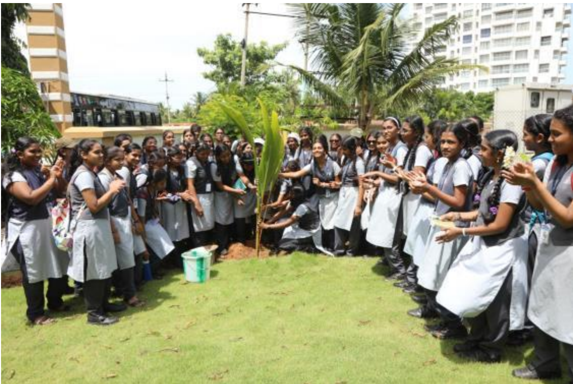
Tree planation by school students of Sri Sankara Global Academy, Kilattalai, Chennai at MES of CIBA, Muttukadu, Tamil Nadu