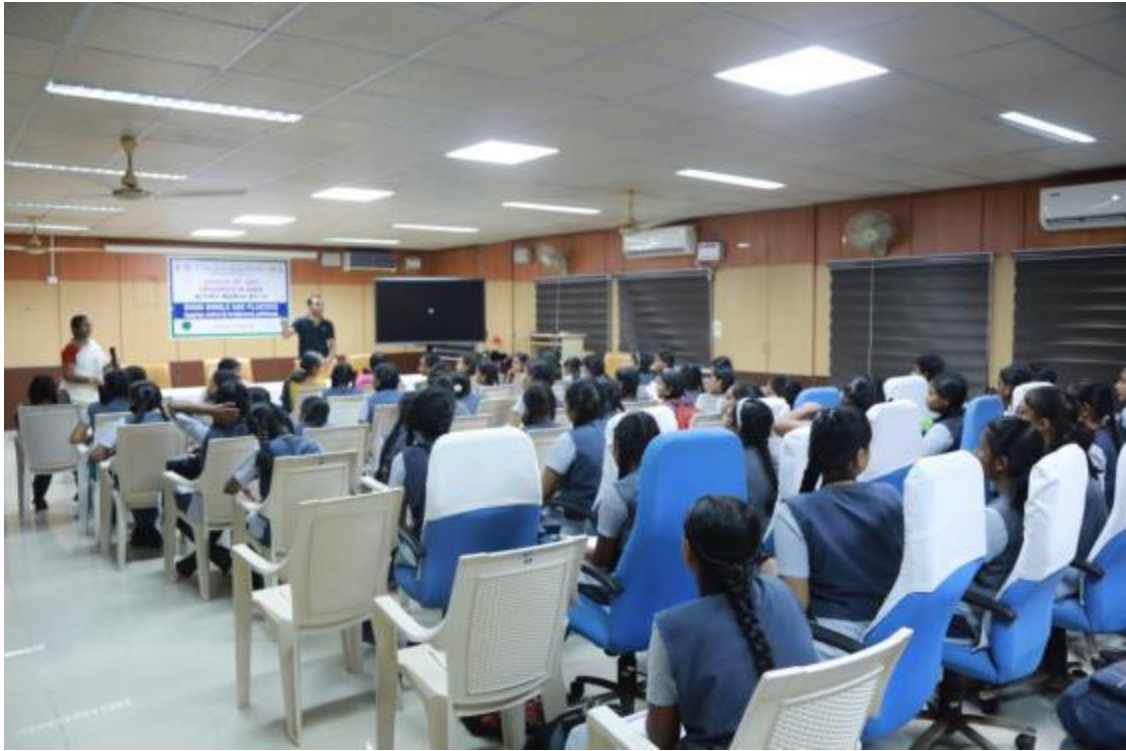
ICAR- CIBA, Chennai, has organized the Swachhata Hi Sewa 2023 programme for school students