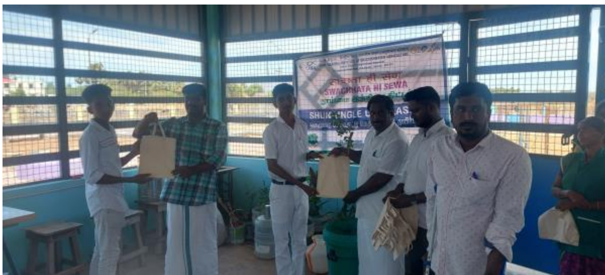
ICAR-CIBA, Chennai distributed cloth bags to school students at Regunathapuram village, Ramanathapuram district, Tamil Nadu