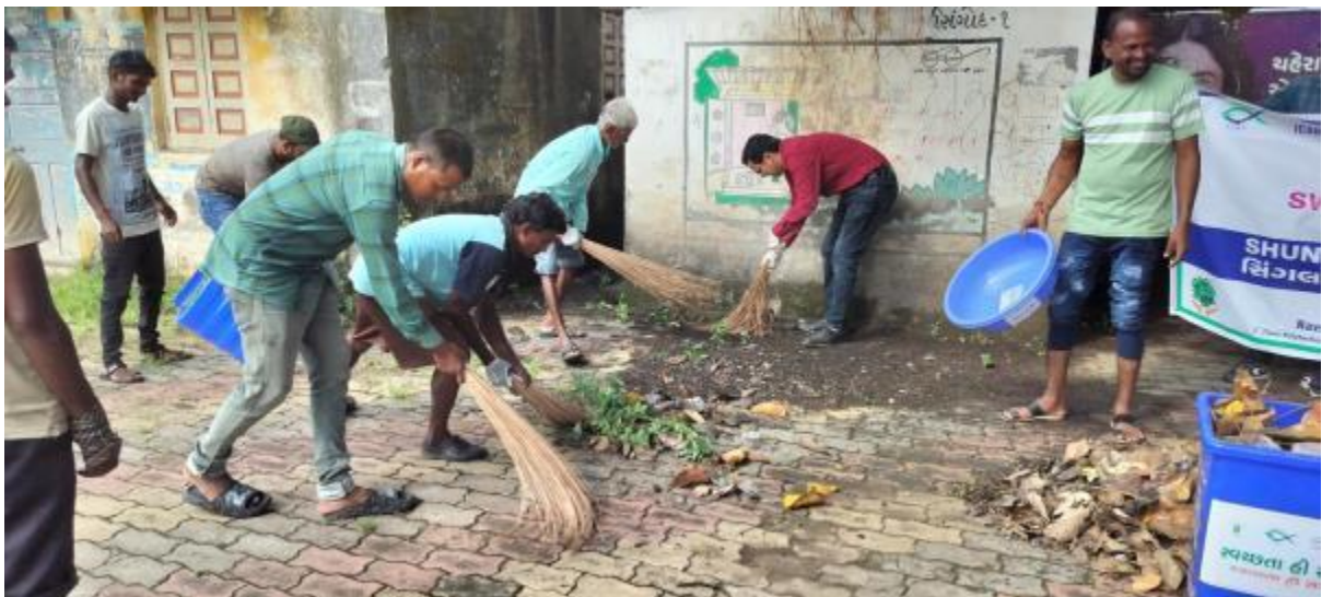
Cleaning of the temple areas and roadside surrounding areas at Singod, Navsari district, Gujarat - NGRC of CIBA, Gujarat