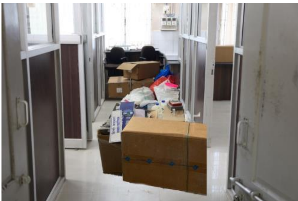
Before cleaning of Laboratory building, ICAR-CIBA, Chennai, Tamil Nadu