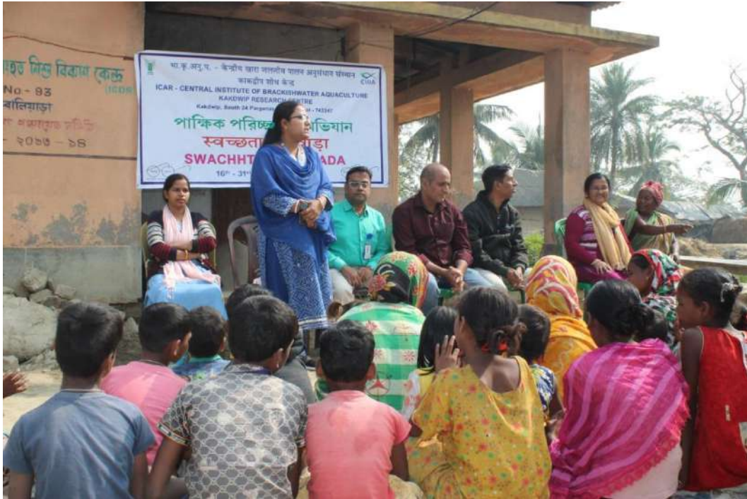
Awareness meeting at Mousani Village, South 24 Parganas district in West Bengal