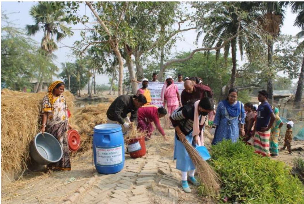
Cleanliness drive for removal of plastic and waste materials in the village premises, Mousani Village, South 24 Parganas district in West Bengal