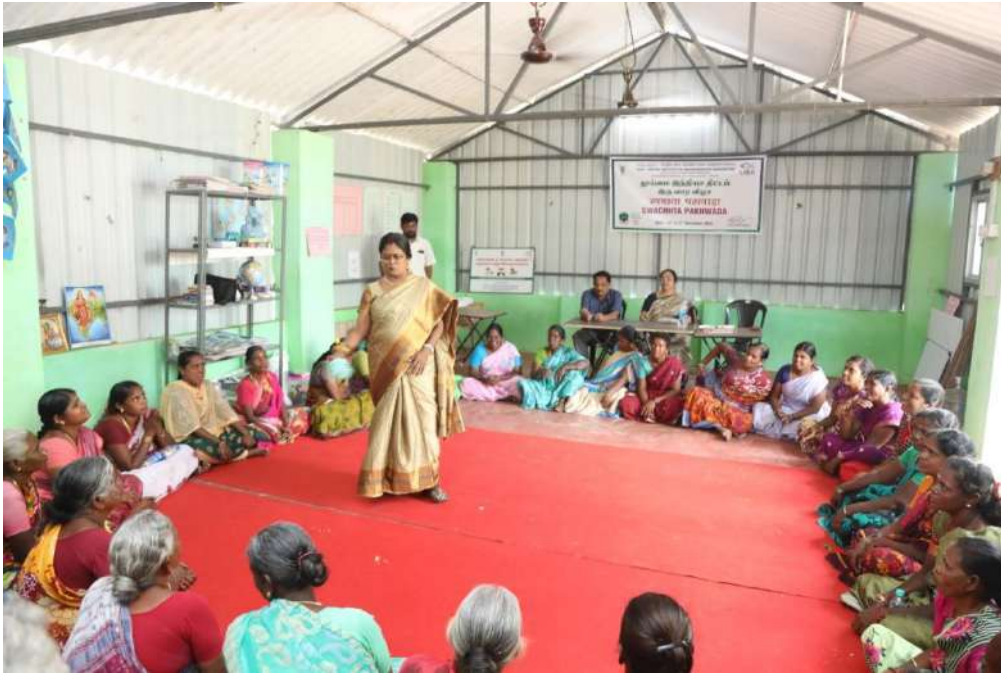
Awareness on “Importance of swachhta campaigns” at Thonirevu village, Pulicat, Tamil Nadu

of single usage plastics, effects of plastic on marine life and oceans, recycling of fish waste to value added products etc. The awareness program was followed by a speech competition wherein 7 coastal women participated and presented their views on a clean and plastic free India with emphasis on negative impacts of plastic on environment, importance of reducing open defecation, water management, how to use domestic wastages. Prizes were distributed to the participants.