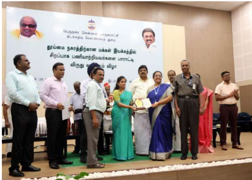
ICAR-CIBA received ‘Appreciation Award’ for the exemplary work in “People’s Movement for Clean Cities -2022” under the Swachh Bharat Mission