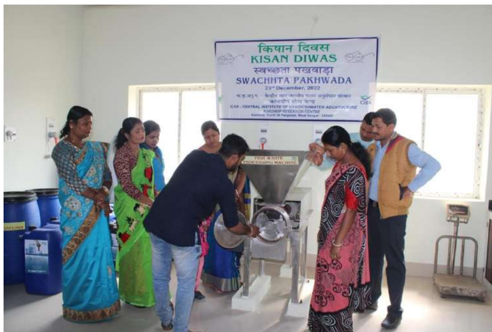
Demonstration of preparation of fish waste to values added product, KRC of CIBA, Kakdwip