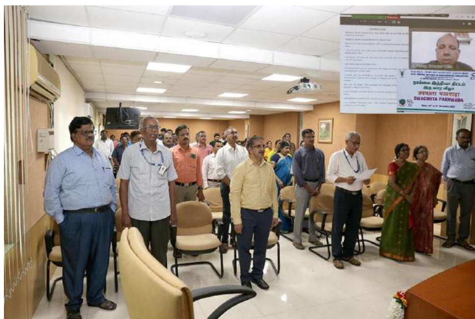
Swachhta Pledge by Scientists, staff, research scholars and students, ICAR-CIBA, Chennai

Swachhta Pledge was taken by the Scientists, Officers, Staff and Students at CIBA Headquarters, Muttukadu Experimental Station (MES) of CIBA, Muttukadu, Navsari Gujarat Research Centre (NGRC) of CIBA, Navsari, Gujarat and Kakdwip Research Centre (KRC) of CIBA, Kakdwip. After the pledge, tree planting was done at MES of CIBA, NGRC of CIBA and KRC of CIBA.