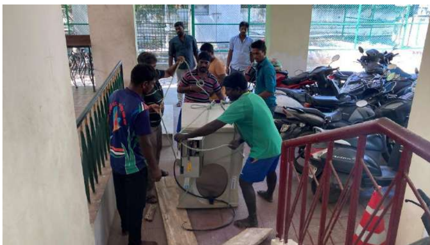
Cleaning of unserviceable items from office premises at Headquarters of CIBA, Chennai

The weeding out of the files and records from Stores, Administration, Audit and Accounts Section and Library and cleanliness drive in various laboratories and common places in the Institute premises including research centres at Gujarat and Kakdwip were undertaken. Due to disposal of materials nearly 600 sq ft space was freed and utilised as a storage facilities, and Rs.8,35,838/- revenue was generated. The processing of files by the Administration, Audit & Accounts and Stores sections were carried out through e-office, being 100% implementation of e-office, this enabling paperless office.