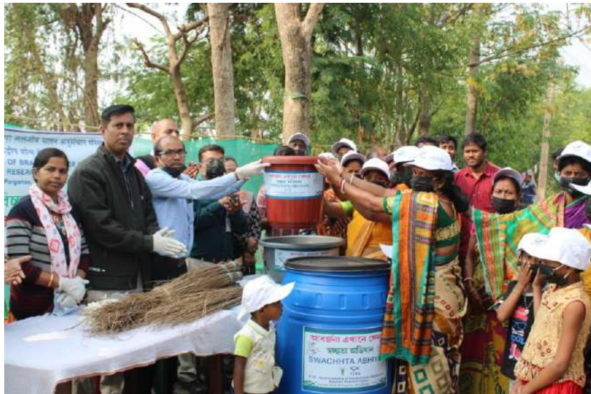
Distribution of cleaning aids and bins for waste disposal to the villagers in Buddhapur Village, South 24 Parganas, West Bengal

ICAR-CIBA has organised awareness programmes on safe disposal of degradable/non-degradable items and shut single use plastic in the adopted villages such as Buddhapur Village, South 24 Parganas, West Bengal, Thonirevu village, Pulicat, Tamil Nadu and Kottaikadu village, Kanchipuram, Tamil Nadu. CIBA staff sensitized the villagers about climate change and importance of cleanliness. Villagers were also briefed about judicious use and safe disposal of single use plastic. They were also apprised about the deleterious effect of various harmful anthropogenic activities like dumping of single use plastic in natural ecosystem, importance of safe disposal of degradable/non-degradable items etc. Later, cleaning of village road, surroundings of a shared facility used by the villagers for community gathering and backwater area and removal of non-degradable items were carried out by villagers.