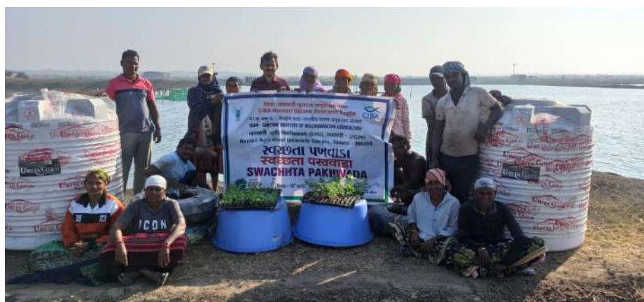
Distribution of vegetable garden materials to tribal farmers, Mendhar vilalge, Navsari, Gujarat

NGRC of CIBA also organized awareness programme on importance of kitchen garden and utilization of pond dyke of Integrated Fish Farming (IFF) model for vegetable garden at Singod, Navsari and Mendhar village, Navsari, Gujarat. CIBA scientists addressed the farmers about the importance of utilization of homestead and fish pond fallow land by converting to kitchen garden for cultivation of horticultural crops and also utilization of pond dyke of IFF model in the form of vegetable garden that provides extra incomes, meet up domestic needs for vegetables and nutrition, and create clean and esthetic surroundings of house and IFF model. This would also help in keeping house premise weed free and maintaining healthy organic environment.