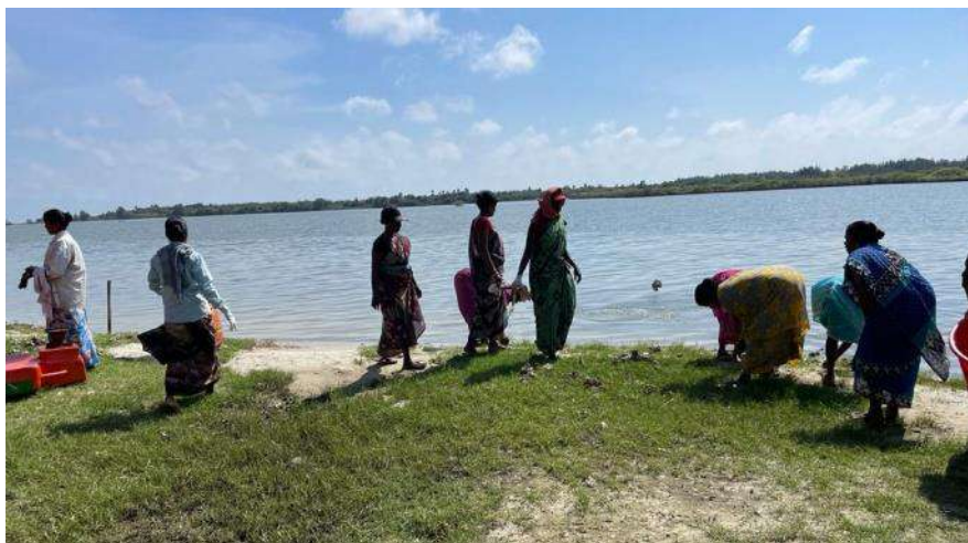
Cleaning of backwater at Kottaikadu village, Kanchipuram, Tamil Nadu