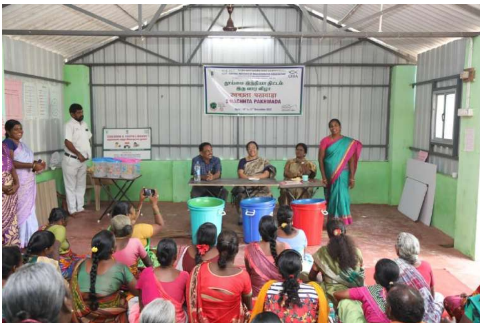
Speech on “Importance of swachhta campaigns” by participants at Thonirevu village, Pulicat, Tamil Nadu