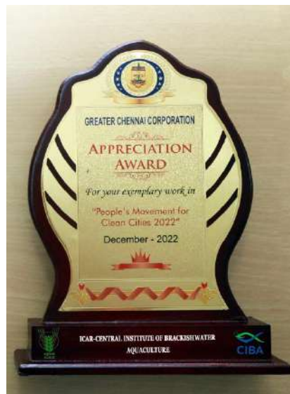
‘Appreciation Award’ for the exemplary work in “People’s Movement for Clean Cities -2022”