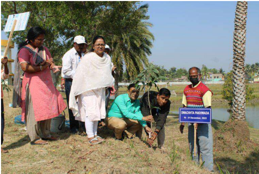
Tree plantation at KRC of CIBA, Kakdwip, West Bengal