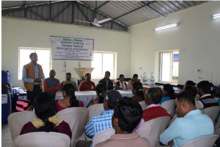
Experience sharing on production and performance of fish waste to value added product, Plankton plus , by M/s TK enterprises, Kakdwip