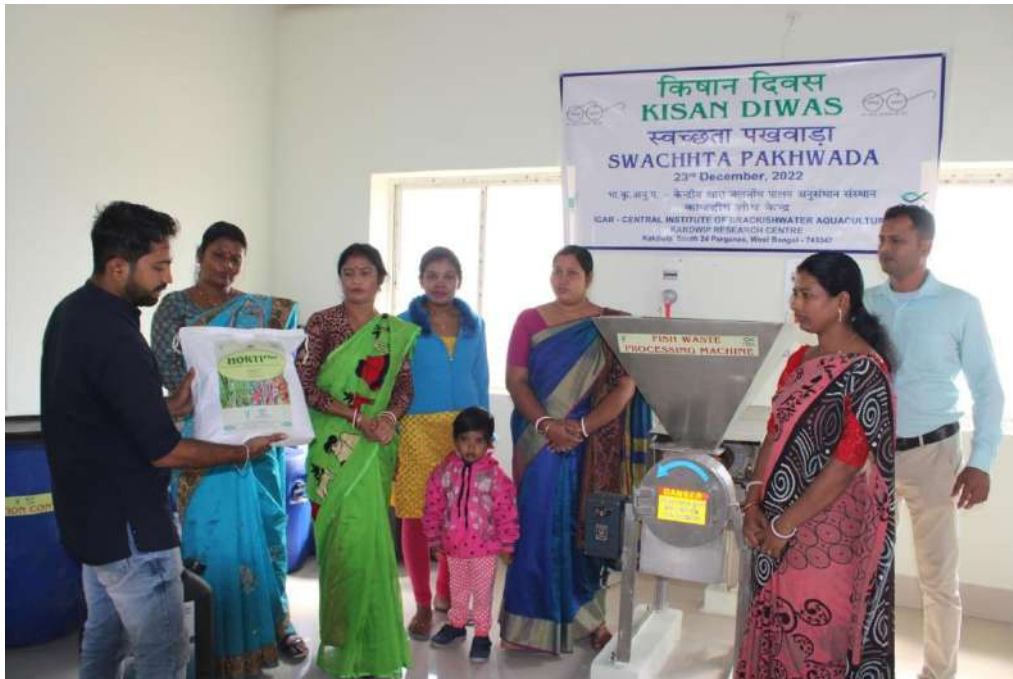
Distribution of fish waste to values added product to self-help group members, Kakdwip