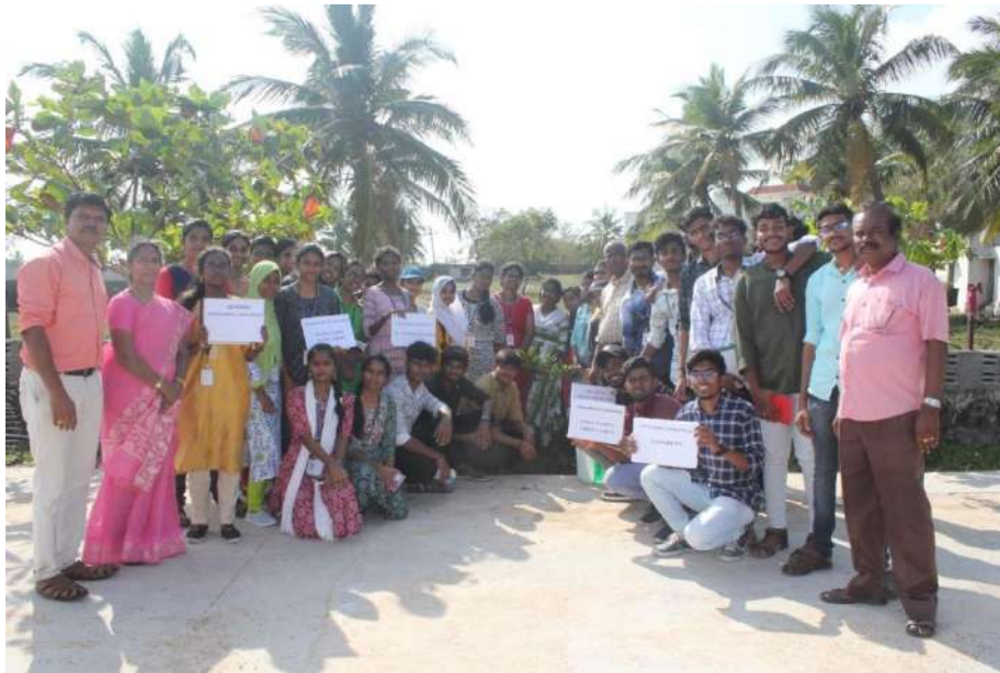
Awareness program and rallies among Fisheries College students and staff of CIBA at MES of CIBA, Muttukadu, Tamil Nadu

Awareness cum rallies and tree planation programme were organised with students and scholars from Fisheries College, Thoothudui and CIBA at MES of CIBA, Muttukadu, Santhome High Road, Santhome and M.R.C main road, Raja Annamalai Puram, Tamil Nadu. Various Placards explaining about different means to avoid plastic waste, go greens, say to no plastics etc was administered to the participants.