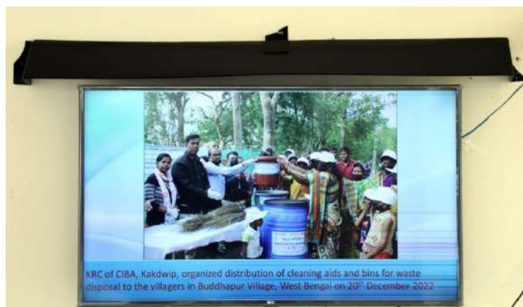
Swachhta Pakhwada activities are posted in CIBA display system