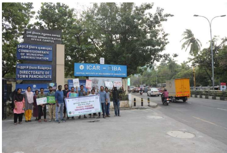
Rallies on shun single use plastics at Santhome High Road, ICAR-CIBA, Chennai