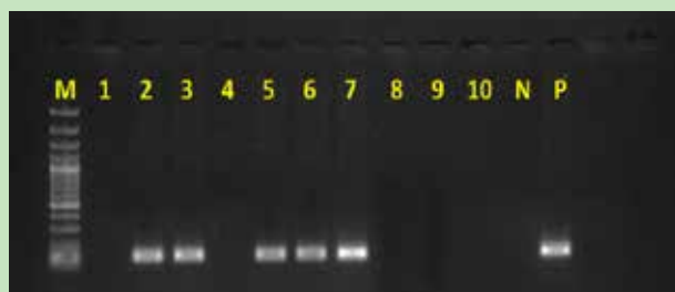
RT –PCR Screening of shrimp samples for IMNV