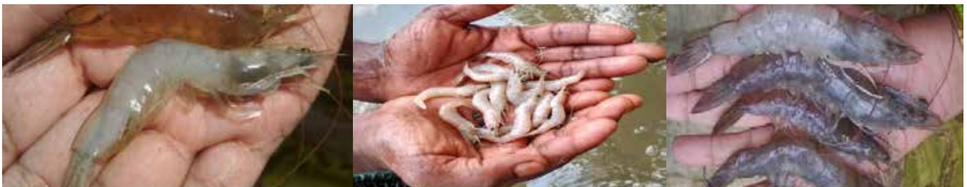
Extensive whitish necrosis appearing like cooked shrimp with reddish distal segments and tail fans.