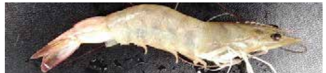
White necrotic areas in the distal abdominal segments of diseased shrimp

Affected shrimp become sluggish, show disoriented swimming behaviour on the surface of water, with abrupt drop in feeding rate. Whitish and reddish necrotic areas can be seen in the distal abdominal segments and tail fan and shrimp may show cooked appearance. FCR of affected populations may increase. Mortalities can be instantaneously high and continue for several days. Generally mortalities range from 40 to 70% in cultivated P. vannamei . Clinical signs may suddenly appear following stressful events such as sudden changes in temperature or salinity. Sometimes disease may progress to a chronic phase with persistent low-level mortalities.